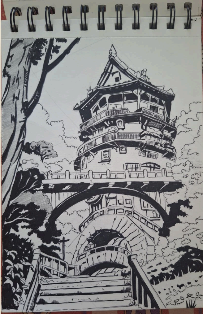
NIKHIL DAS S6 ECE